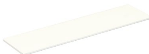
New end cover with magnets system