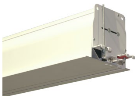
New casing and new design