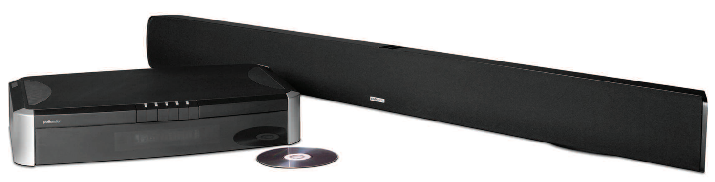
SURROUNDBAR360° DVD THEATER